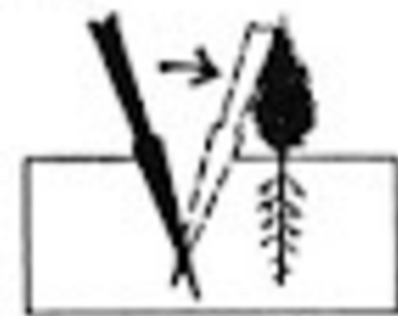
5. Push handle of dibble forward from planter firming soil at top of roots.