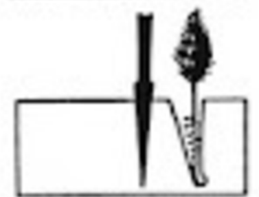
3. Insert dibble 2 inches toward planter from seedling.