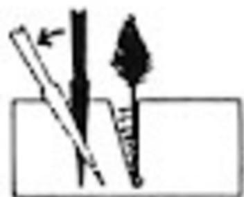
4. Pull handles of dibble toward planter firming soil at bottom of roots.