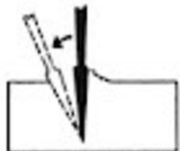
1. Insert dibble as shown and pull toward planter.