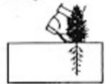
6. Firm soil around seedling with feet.