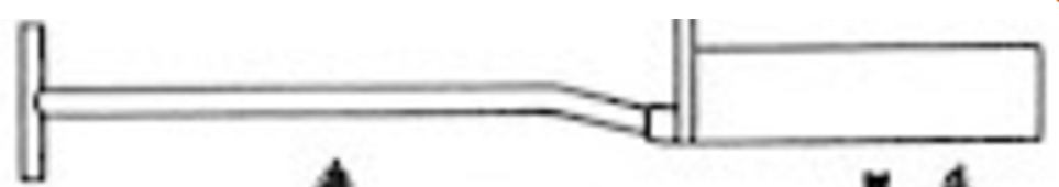
2. remove dibble and place seedling at correct depth.